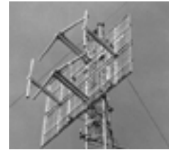
Model 904CP panel

Both directional and omnidirectional patterns are available and beam tilt and null fill can be customised to specification. Panels are fed through a power divider network that is designed to meet the power handling requirements of the array.