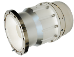
Connector 6-1/8" EIA

RFS connectors are fully tested for mechanical and electrical compliance specifications. HELIFLEX®Lite premium connectors have excellent electrical values and provide outstanding performance for the most demanding applications. The RFS connector design provides maximum sealing integrity and gas tightness.