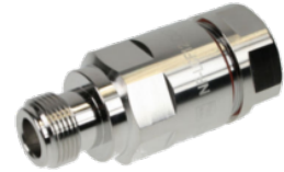
OMNI FIT™ Standard Connectors

OMNI FIT™ high performance connectors are designed for use with both CELLFLEX® (copper) and CELLFLEX® Lite (aluminum) cables. They are designed specifically to provide the highest quality connector-cable interface while simplifying and speeding up connector attachment. All RFS connectors are fully tested for mechanical and electrical compliance to industry specifications.