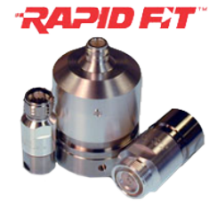
RAPIT FIT™ Connectors

Radio Frequency Systems line of high performance coaxial cable connectors are designed specifically to provide the highest quality connector-cable interface while simplifying and speeding up the attachment of connectors to CELLFLEX® coaxial cables. RFS connectors are fully tested for mechanical and electrical compliance specifications. They are available in all popular cable sizes in a variety of mating interfaces. The N connector is one of the most common RF connector types. N type connectors from RFS will be delivered with a non-slotted outer conductor contact sleeve and a special gasket. Due to a special design of the coupling nut (without spring ring) N connectors can be tightened with increased torque. This increases the contact pressure.